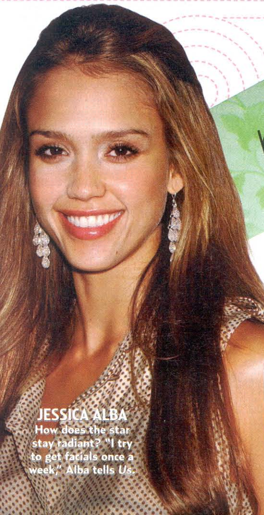
JESSICA ALBA How does the star stay radiant? "I try to get facials once a week," Alba tells Us .